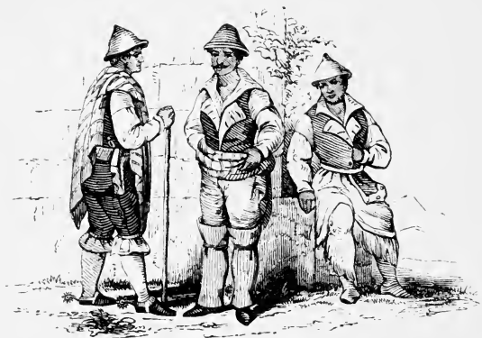
NATIVES OF VALPARAISO.